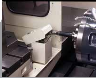
Automatic Tool Length Measuring